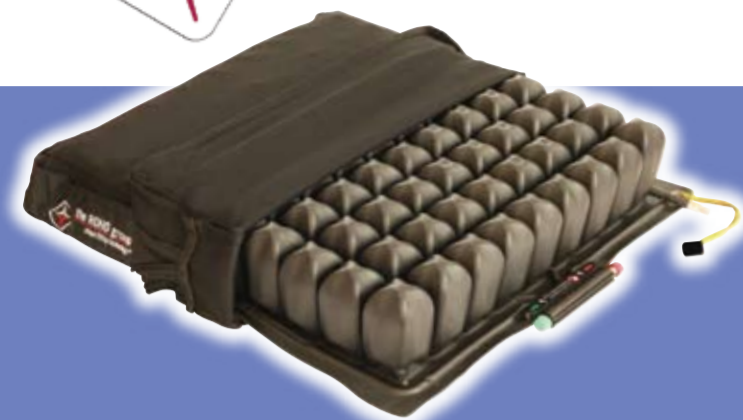
High quality air cushion range with DRY FLOATATION® technology. Excellent for positioning, pressure relief and for therapeutic use.