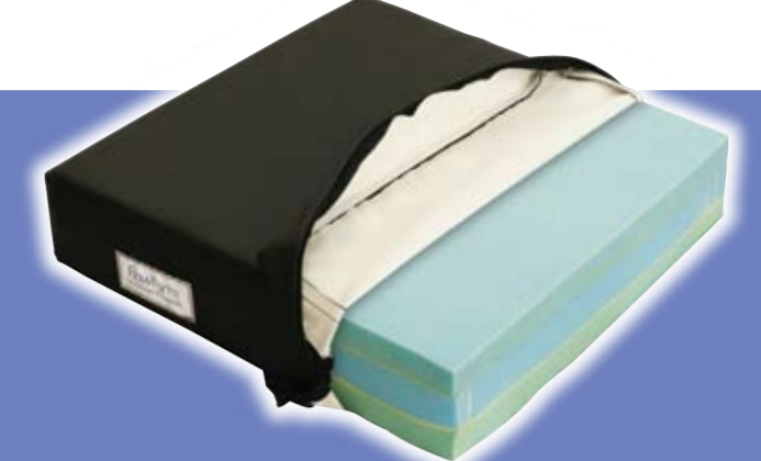
Fluid filled module technology with viscoelastic foam casing that can be used any way up or round