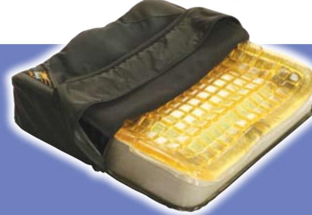
Range of cushions incorporating Akton® viscoelastic polymer gel.